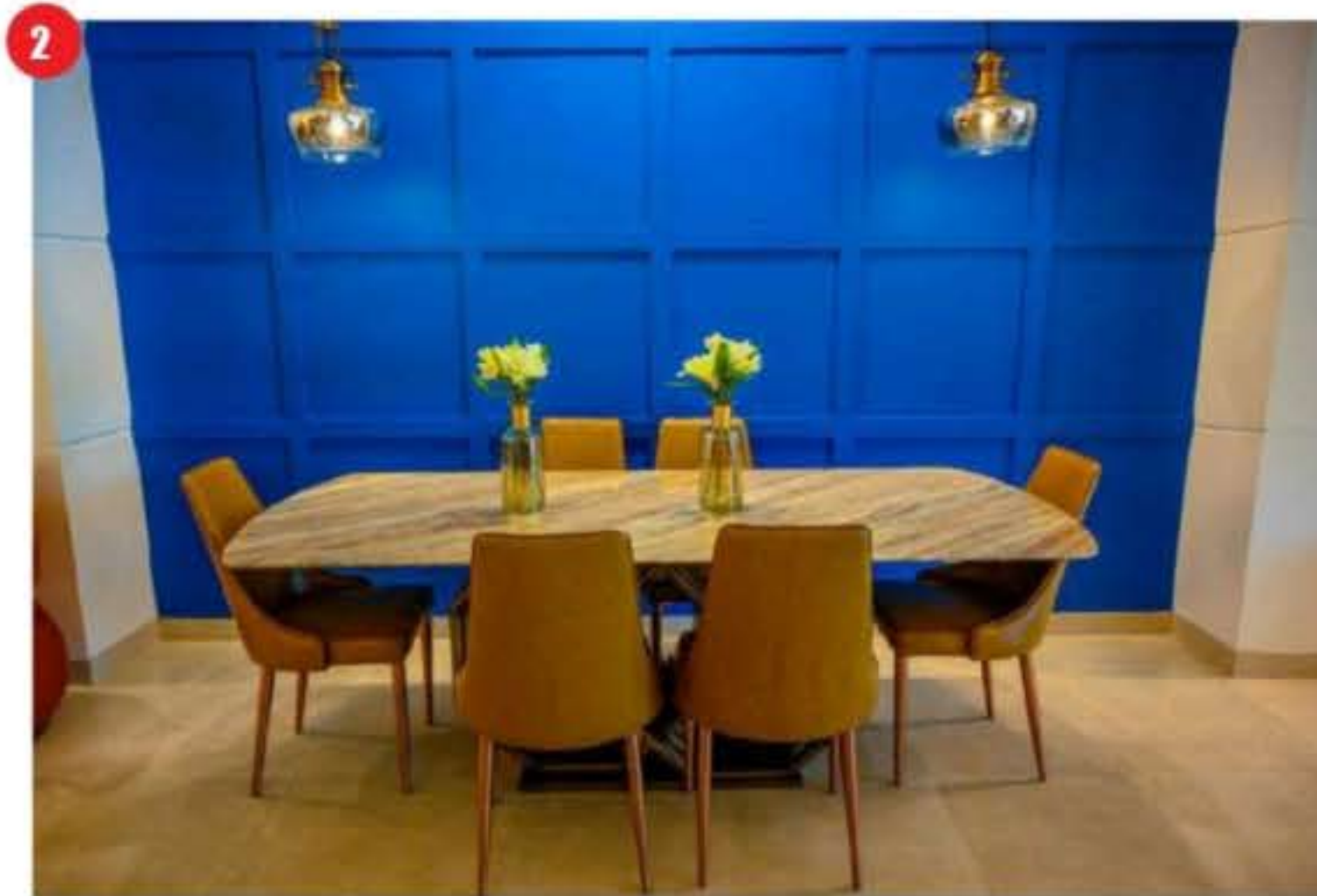
2. Symbol of Luxury The newly launched Coppice Furniture has launched marble-top dining table that is inspired by the forms of art, fashion and luxury and are rendered in varied materials in exotic woods and metals. The brand also showcases furniture for living and bedrooms. ( coppicefurniture.com )