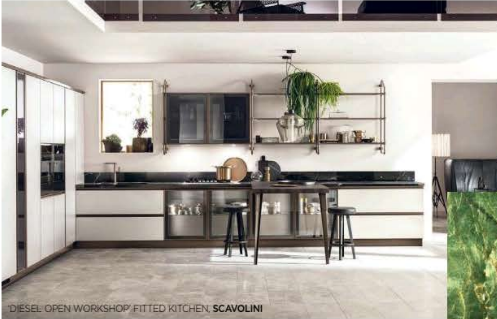
'DIESEL: OPEN WORKSHOP' FITTED KITCHEN, SCAVOLINI