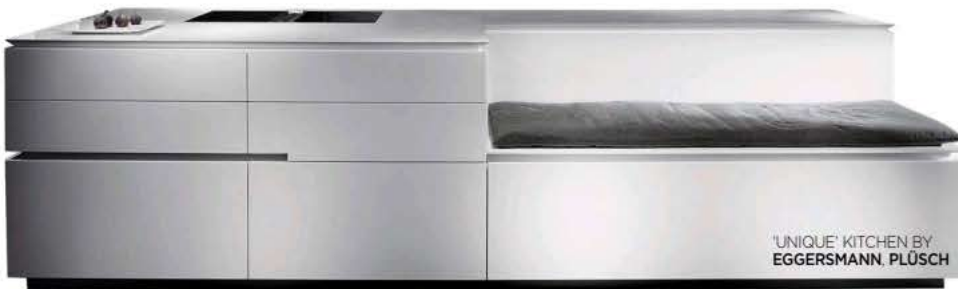
'UNIQUE' KITCHEN BY EGGERSMANN, PLÜSCH