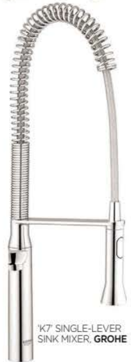
'K7' SINGLE-LEVER SINK MIXER, GROHE