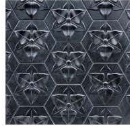
'FOGLIA' NATURAL BLACK STONE WALL CLADDING, TOPSTONA