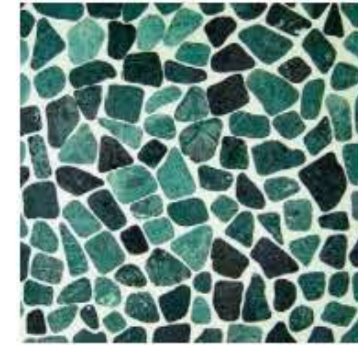
'LYON POLISHED STONE CARPET' MOSAIC (LEFT), 'NO-41' CERAMIC ROMAN MOSAIC (BELOW), KERAMOS